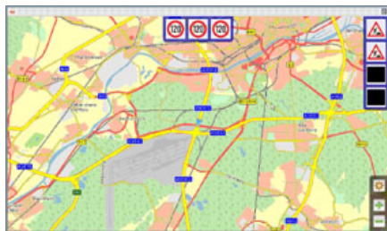
(sbaAnzeige_ptv01.bmp) Dynamic speed information in the vehicle