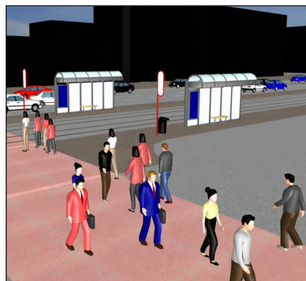
Multi-modal traffic simulation with true interactions.

The Social Force Model by Helbing et al. was the first model for pedestrian simulation which generated wide public interest. It dates back to 1995 and was used in many projects. Since then, it has been enhanced a few times. A number of new changes were implemented for its very general use in VISSIM. Its general approach is flexible and it has recently been demonstrated that it can easily be extended to simulate extreme situations, such as the Hajj in Mecca.